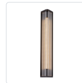
WV339123UBCR Ribbed Glass/Urban Bronze