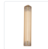
WV339123VBCR Ribbed Glass/Vintage Brass

*For complete warranty terms, please visit: www.aloralighting.com/warranty