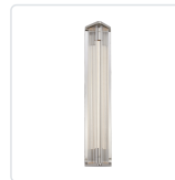
WV339123PNCR Polished Nickel/Ribbed Glass