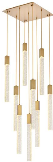
Stain Gold Item No: 2066D20SG