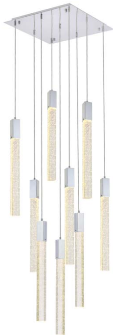
Chrome Item No: 2066D20C