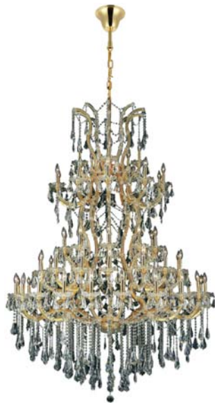
Gold Item No: 2801G54G