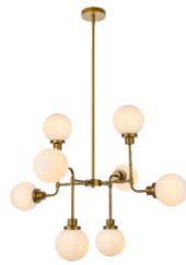
Brass Item No:LD7038D36BR