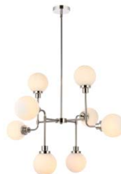
Polish Nickel Item No:LD7038D36PN