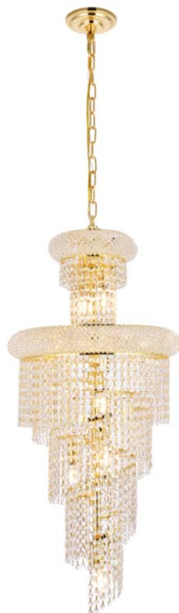
Gold Item No: V1800SR16G