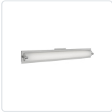
601001BN-LED Brushed Nickel