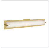
601001BG-LED Brushed Gold

Single lamp vanity with white opal glass cylinder and frosted side covers, metal details available in black, brushed gold, brushed nickel or chrome finish. Equipped with our powerful 120V AC LED technology. Available in three different sizes see series for full details.