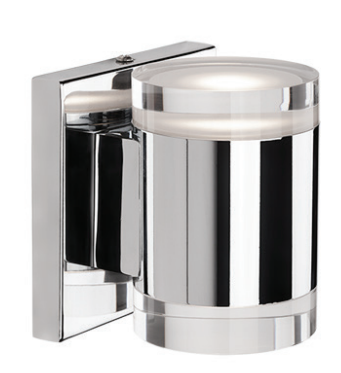
CH - Chrome