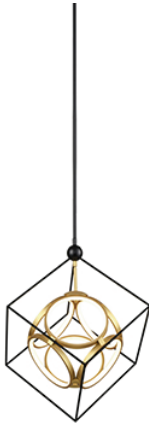
BK/AN - Black/Antique Brass