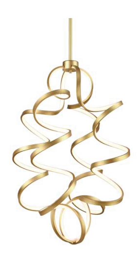
AN - Antique Brass