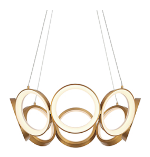
AN - Antique Brass