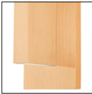
GD - Gold*