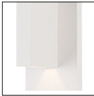
WH - White