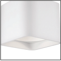
WH - White