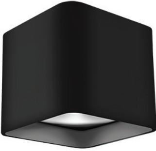
BK - Black