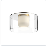
FM53512-BG/CL Brushed Gold/Clear