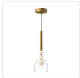
PD30505-BG/CL Brushed Gold/Clear