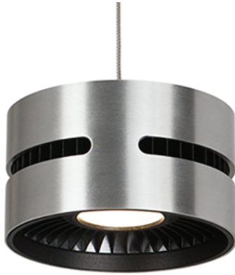
BN - Brushed Nickel