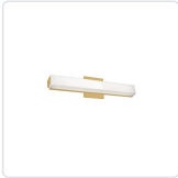
VL47221-BG Brushed Gold