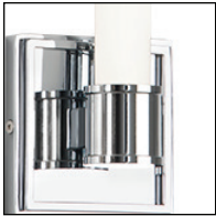
CH - Chrome