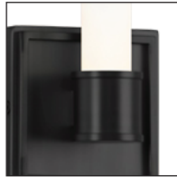
BK - Black