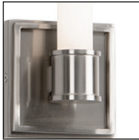
BN - Brushed Nickel