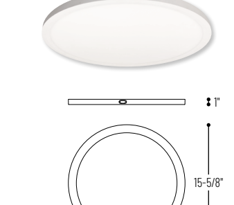
NELOCAC-16R 16" ELO