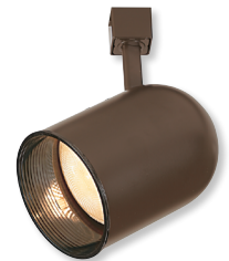
NTH-106BZ Bronze Roundback Cylinder with Black Baffle