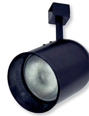
NTH-106B Black Roundback Cylinder with Black Baffle