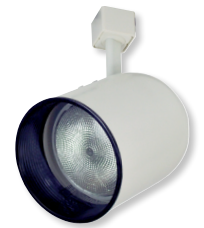
NTH-106BZ Bronze Roundback Cylinder with Black Baffle