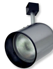
NTH-106B Black Roundback Cylinder with Black Baffle