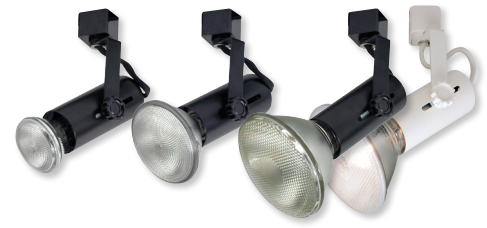
shown with PAR20