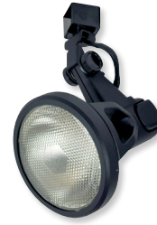
NTH-133B Black Belgium™ Front Loading Gimbal