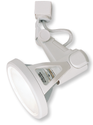
NTH-133W White Belgium™ Front Loading Gimbal