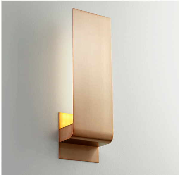
-25 Satin Copper