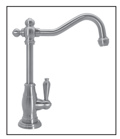
VICTORIA COLD ONLY

A separate air gap is available for reverse osmosis on this model.