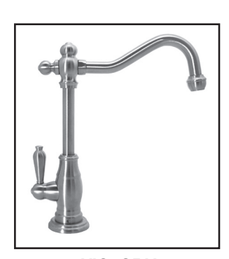
VICTORIA HOT ONLY