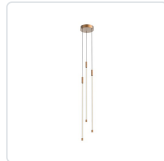
MP75227-BG Brushed Gold